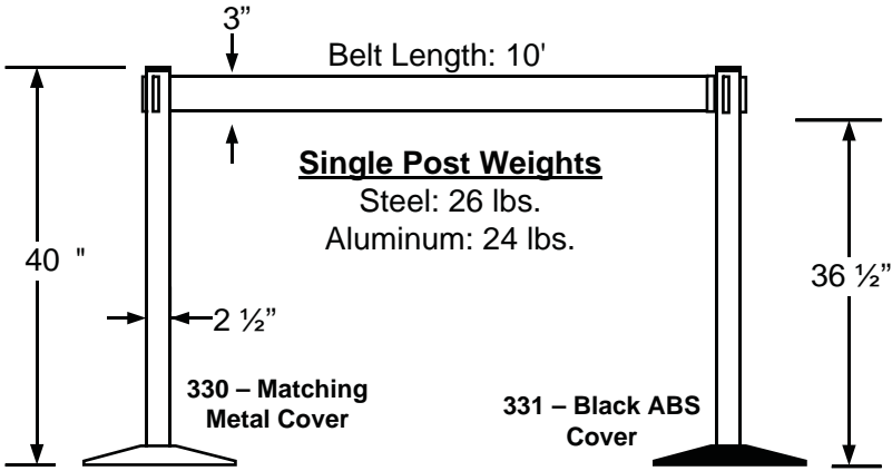
Specs for 10' Single Line Retractable-Belt with 3" Belt (other post models available)