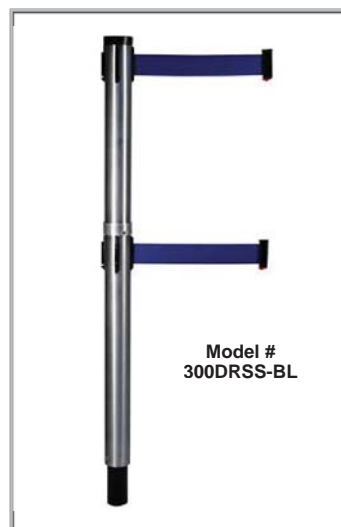
Model # 300DRSS-BL