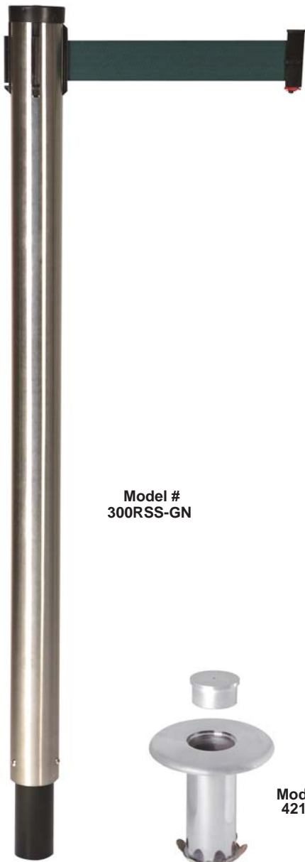
Model # 300RSS-GN