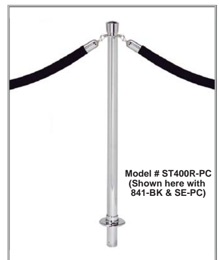
Model # ST400R-PC (Shown here with 841-BK & SE-PC)