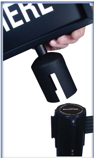
All Retracta-Belt® PRIME Sign Frames attach to posts with our black Adapter Cone