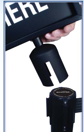
All Retracta-Belt® PRIME Sign Frames attach to posts with our black Adapter Cone