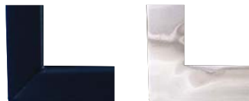
Smooth Black (SB) Polished Chrome (PC)