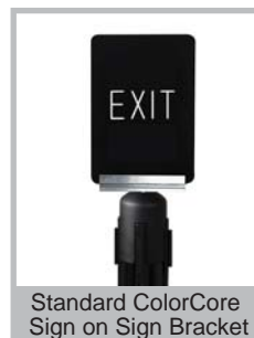
Standard ColorCore Sign on Sign Bracket