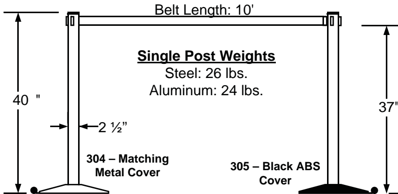
Specs for 10' Single Line Retractable-Belt with Retractable-Wheel Base (other models available)

^ A black head will be substituted on weatherproofed 15' Models