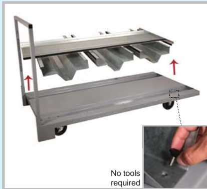
No tools required

Versatile, multi-use flat cart: top post rack separates easily so it can be used as a regular flat cargo cart