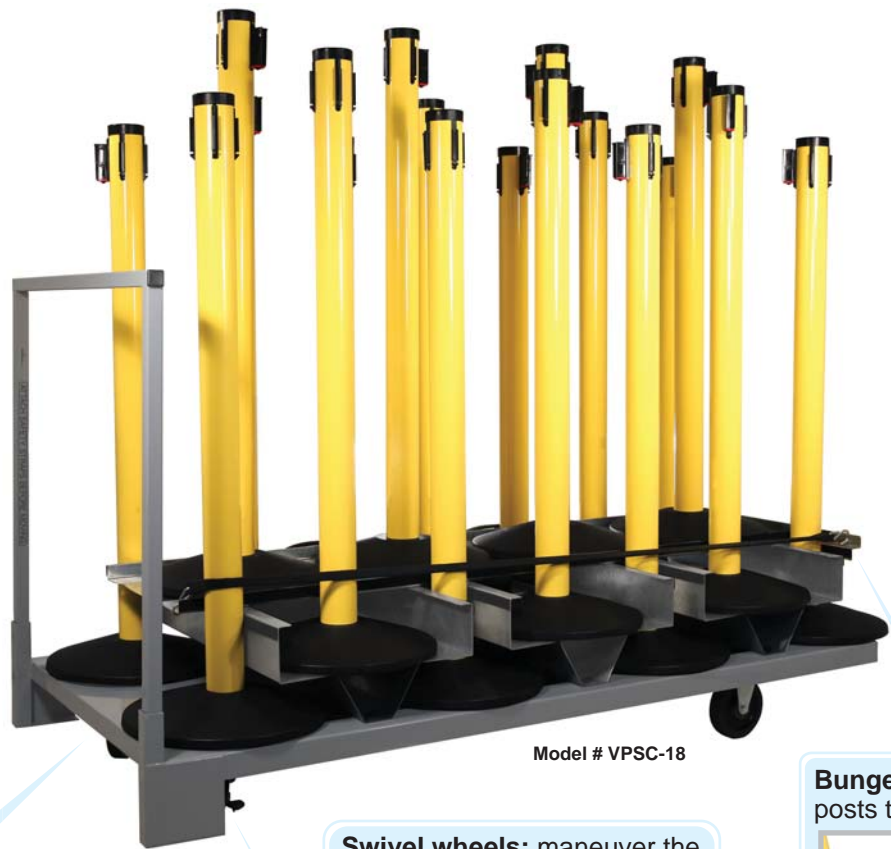
Model # VPSC-18

Versatile, multi-use flat cart: top post rack separates easily so it can be used as a regular flat cargo cart