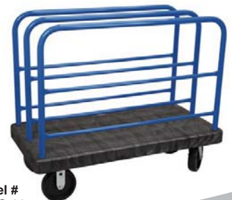
Model # PNPSC-22