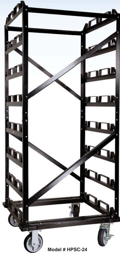
Model # HPSC-24

Assembles quickly and easily: in about a half hour by one or two people, compared to up to an hour and a half for other similar storage carts. All tools and hardware included.