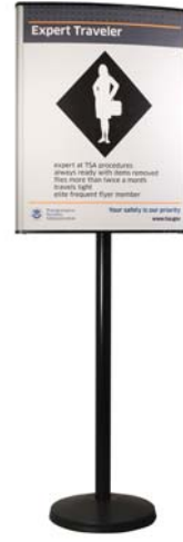
Basic: Silver Frame Black Post