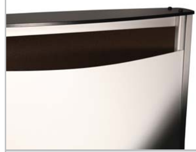
Printed Rigid Sign: Graphics are printed directly onto PETG and laminated to prevent scratching. Ideal for more permanent signage.