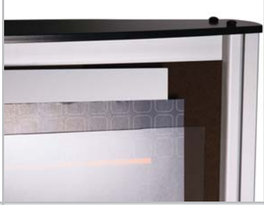
Paper Poster Holder: Rigid white sintra backer and a clear PETG protective panel. Ideal for temporary signage.