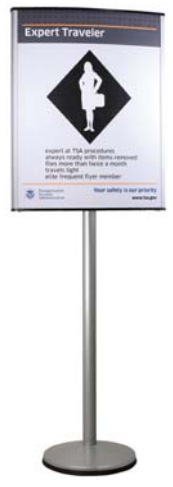
Silver: Silver Frame Silver Post