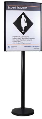
Black: Black Frame Black Post